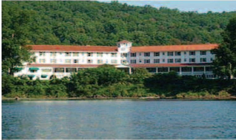
Shawnee Inn and Golf Resort