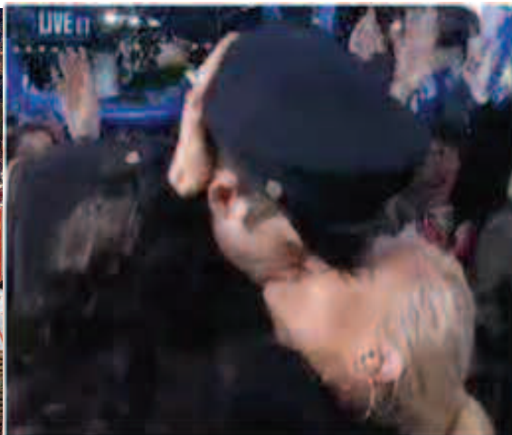
Pictured to left; an estimated record crowd of 1.5 to 2 million people ring in the New Year in Times Square. Pictured to right; Lucky NYPD cop gets a big kiss from Jenny McCarthy.